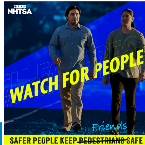
Social Post 1200x1200

On the left are two sample social media graphics: one for social stories on Instagram and Facebook and one for social feed posts that can be used on any platform.