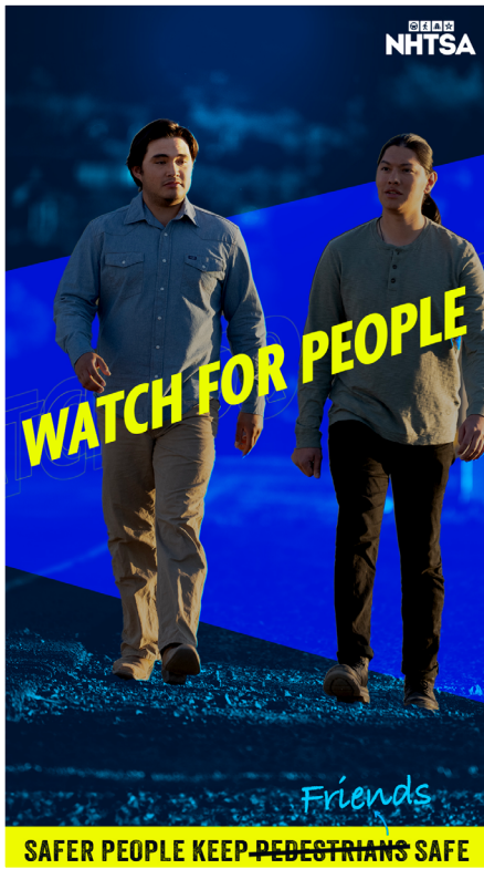
Social Story 1080x1920

This section contains shareable social media content for the 2024 Pedestrian Safety Month campaign period. Provided on pages (12-29) are downloadable graphics with accompanying suggested posts that you can use or use as inspiration when sharing on your social media channels.