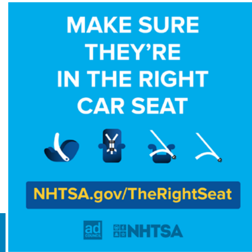
Social Post 1200x1200

On the left are two sample social media graphics: one for social stories on Instagram and Facebook and one for social feed posts that can be used on any platform.