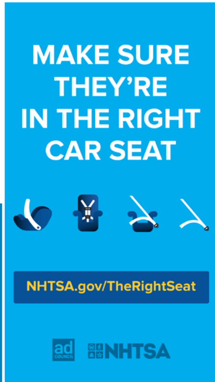
Social Story 1080x1920

This section contains shareable social media content for the 2024 Child Passenger Safety Week and Child Car Safety campaign period. Provided on pages 13-20 are downloadable graphics with accompanying suggested posts that you can use or use as inspiration when sharing on your social media channels